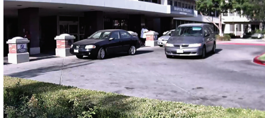
Sarix with SureVision (on the bottom) handles this WDR scene automatically.

Low-light scenes are typical for outdoor cameras. These underlit scenes are often where security needs are the highest. Again, many currently available LL/WDR cameras do reasonably well in these scenes, providing usable images down to 1 lux and below, but only when wide dynamic range is turned off manually.