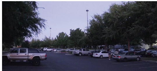
Sarix with SureVision (on the bottom) handles this low-light scene automatically.