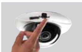
Fast and Easy Installation that Requires Practically No Tools

Your chance has arrived to own the world's most advanced indoor network fixed dome camera. The Sarix ID Series raises the bar by combining the powerful performance of Sarix technology along with innovations and benefits not found in any other integrated dome. Pre-ordering is now underway and units start shipping in November, 2009. From the remarkably easy installation, to the innovative Auto Back Focus that can achieve perfect focus after the dome has been installed, the Sarix ID Series sets a new standard for features and performance. High-quality interchangeable CS mount lenses, along with an optional 15-50mm lens, further enhance versatility. Contact your local Pelco sales representative today to order, or visit www.pelco.com/ip to learn more about these industry-leading imaging systems.